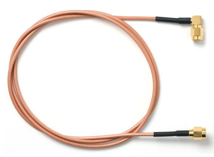
Model 73069 SMA Plug to SMA Right-Angle Plug, RG316/U