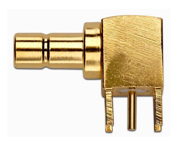
Model 72998 SMB JACK R/A PCB RECEPTACLE