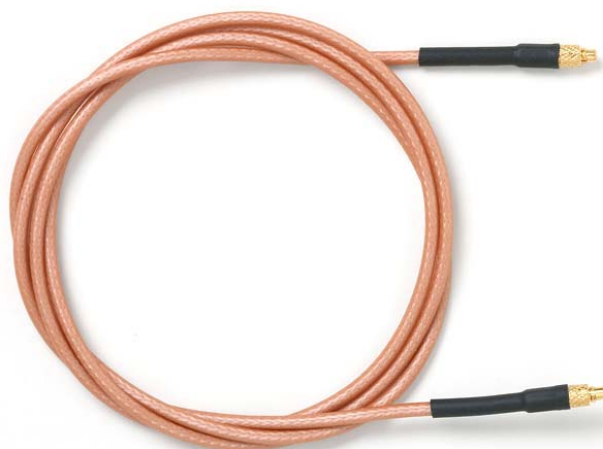
Model 73063 MMCX Plug to MMCX Plug, RG316/U

Snap-on coupling and micro-miniature size for fast connect and disconnect where space is limited