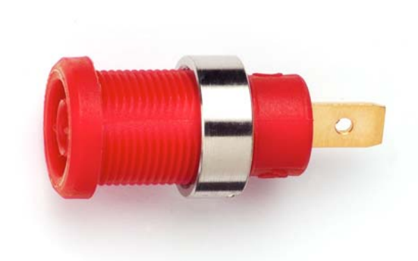
Model 72913 Panel Mount IEC61010 4mm (0.16in) Jack for Sheathed Banana Plugs

Panel Mt IEC61010 4mm (0.16in) Jack for Sheathed Banana Plugs